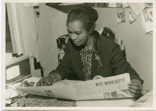
Claudia Jones (c. 1960s)