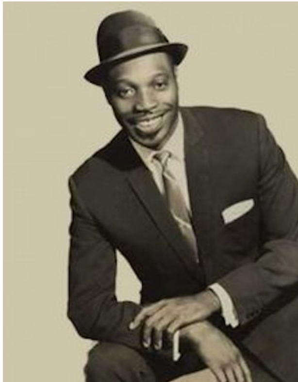
Aldwyn Roberts (“Lord Kitchener”)

The idea that he could create this song—this representation of his sense of attachment to Britain before he arrives—opened up a way for me to think about his performance as a moment that was important not just because of the news that it made around the arrival of the Windrush , but also for what it tells us about Afro-Caribbean migrants’ affinities and attachments to Britain, their sense of imperial belonging, their everyday notions of citizenship, and their ability to lay claim to British identifications well before living, settling, and creating community in the U.K. So, for those reasons, it was an interesting moment to reconsider.