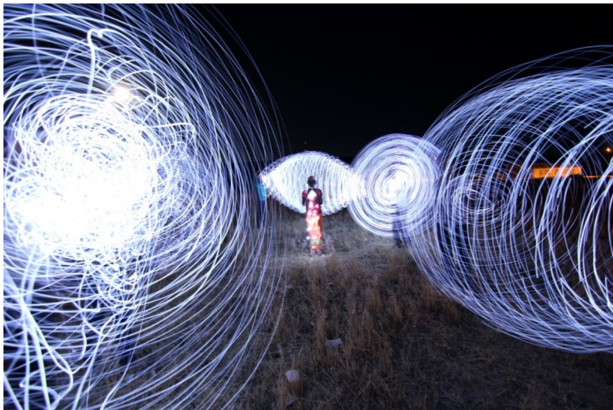
'One Woman at the Centre of the Universe' audience-performers interacting with rope lights in Karoo, South Africa, 2015.