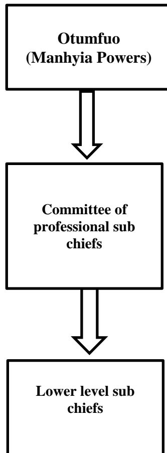
Figure 2: Process of Land Conflict Resolution at the Manhyia Palace

Resolution of land conflicts within the traditional area passes through the process described in Fig. 2. According to Aikins (2012), at the Manhyia Palace, the case is first of all heard at the lower level sub chiefs, who also belong to divisions. These divisions include the Akom , the Krontire , and others. After the role of the lower level sub chiefs, may be in the case where the ‘great oath swearing’ could not resolve a conflict, it would be forwarded to the committee of professional sub chiefs, who also presents their findings to Otumfuo for his final verdict. Obviously, cases move through the hierarchical divisions until it finally reaches the Otumfuo . In sum, the Otumfuo ’s structures had pre-empted many potential conflicts in Kumasi (Aikins, 2012).