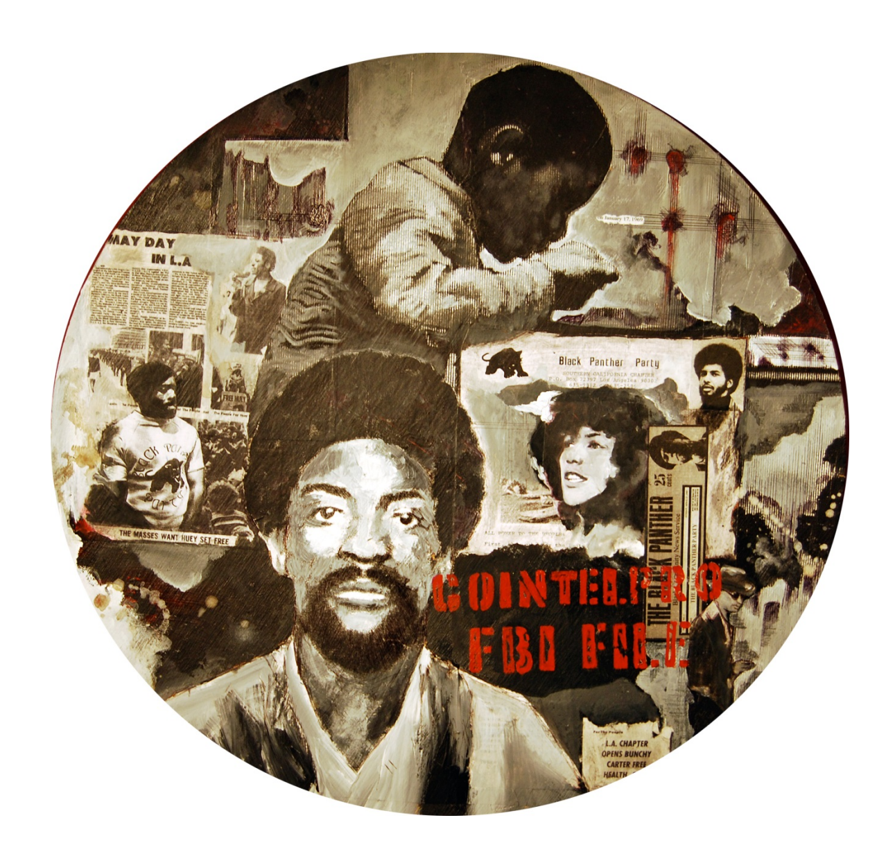
"LAPB" (Figure 5)

"LAPB" also joins a large tradition of recent African American artists who provide an alternative to conventional stereotypes about the Panthers. His view offers a welcome to more sympathetic vision. It also brings Bunchy Carter back into public consciousness and provides audiences with an insight into recent history they seldom find in conventional media and educational sources.