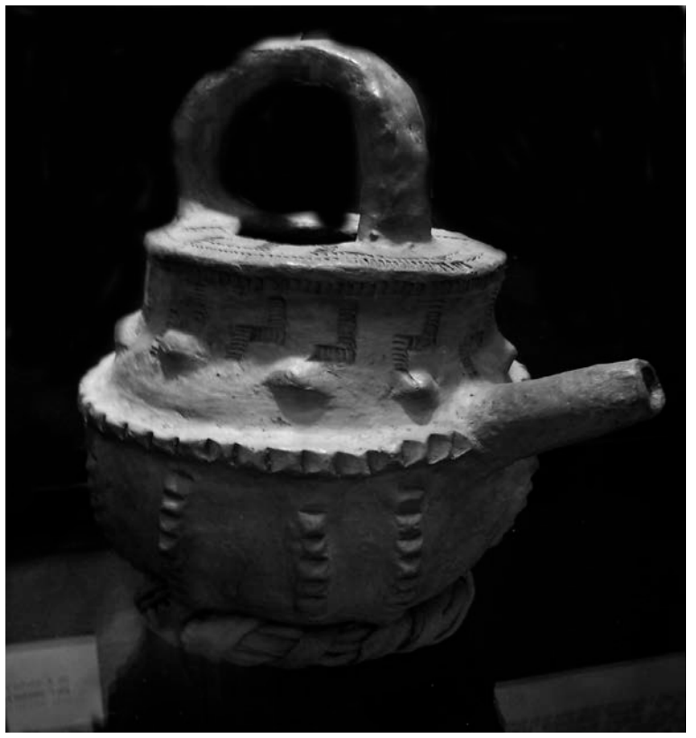
Figure 4 : Pottery reproduction of a metal teapot, early nineteenth century from Arroyo de Leyes (Museo de la Facultad de Humanidades y Arte , University of Rosario).