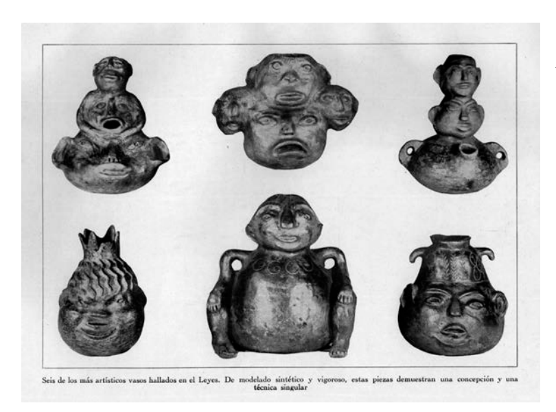
Figure 3 : Six bulbous heads from Arroyo de Leyes published in 1938 (Courtesy: Library of the Instituto de Arte Americano , University of Buenos Aires).