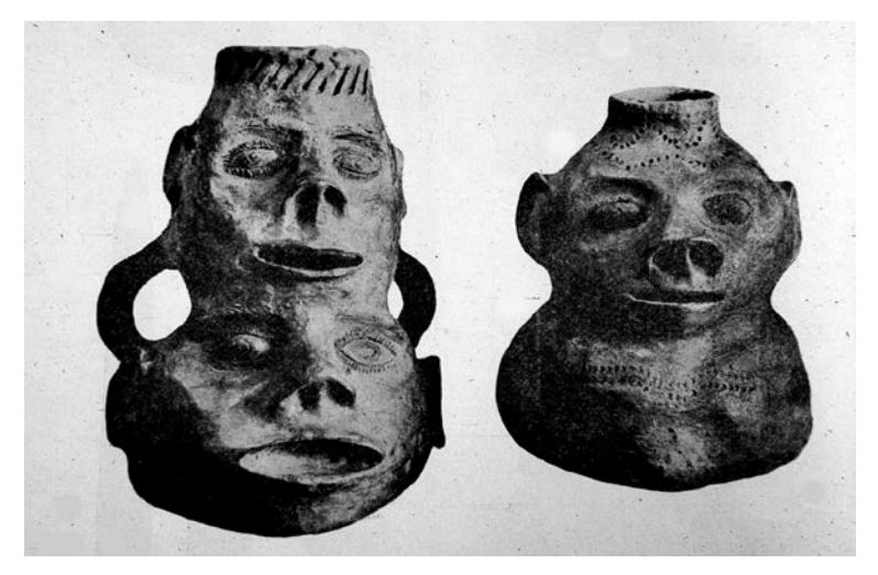
Figure 1 : Two pottery vessels founded during the Francisco de Aparicio controlled archaeological excavations in 1935 (Courtesy: Library of the Instituto de Arte Americano , University of Buenos Aires).

By the time of the early days of Argentine scientific archaeology, the Arroyo de Leyes pottery already had a tentative chronology and an ethnic attribution, flimsy though it was, and all the experts agreed that these were not pieces of pre-Columbian pottery. We can now interpret this as one more attempt to identify a carrier culture of the pottery in the historic-cultural tradition of anthropology, following the ideas of the time. But there were no excavation reports, which was a serious drawback. Such was the prevailing strength of the view of the object outside of its context. During the time of the discovery a first and unique great exhibition of the pottery was organized at the Ethnographic Museum in Buenos Aires in 1935, backed by the active society Los Amigos del Arte , which presented a large part of Bousquet's collection, later on donated to the Museum. It was a major event in the city and it helped to arouse interest in these strange ceramics. The brochure emphasized their aesthetic value and attributed the objects to the Mocovi people of the eighteenth century, as mentioned above. For the moment, the matter seemed closed.