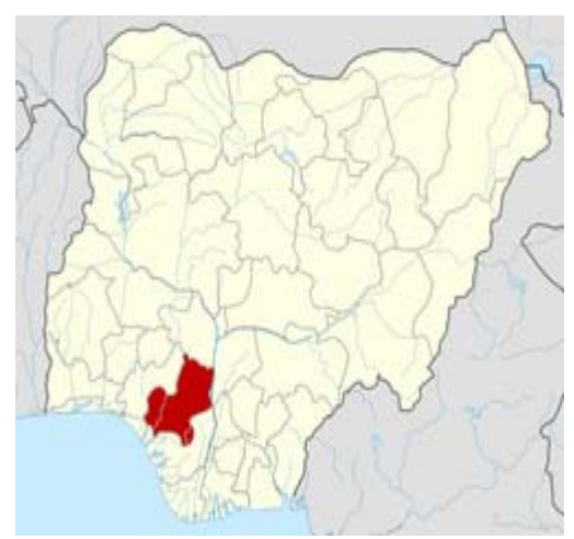
Fig.I: Edo State on Nigerian map.