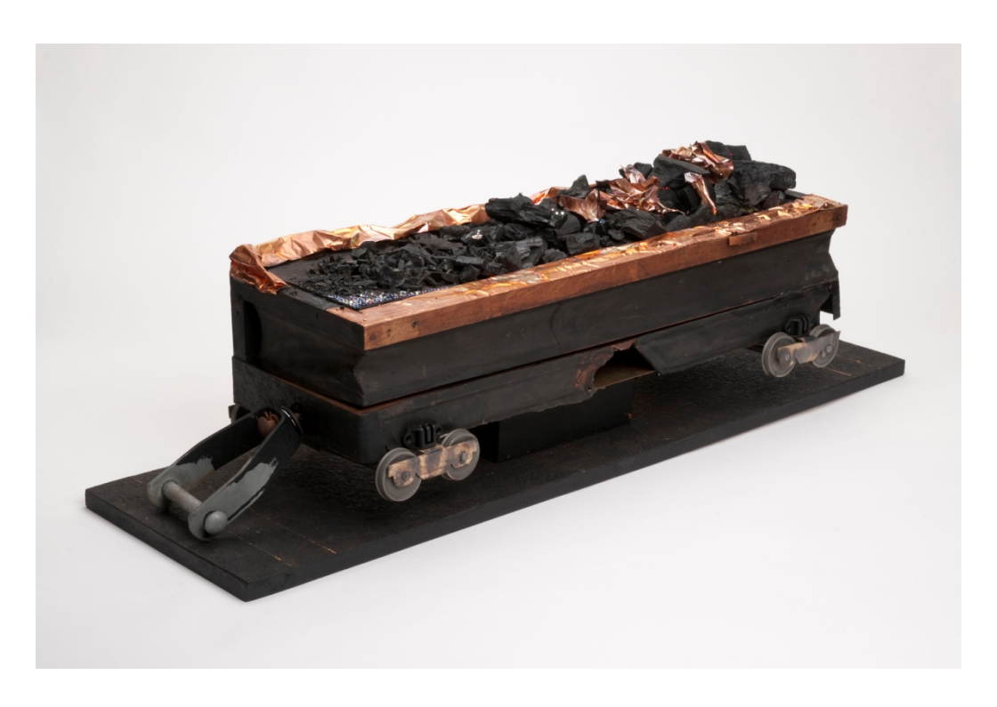
"Coal Car #1" (Figure 4)

Davis's artwork is the cultural counterpart to the efforts of environmental activists who seek to counter the "benefits" of those corporations whose primary interests are nothing more than short term profits, in total disregard, and even contempt for longer term human health and safety. As a critical artwork, "Coal Car #1" impels viewers to question some of the most significant contemporary issues of the early 21<sup>st</sup> century. And in this, the artist perform an exceptionally valuable instructional service (following a career as a professional educator) by catalyzing his viewers to investigate the hydraulic fracking issue for themselves; hence, vitally important in a democracy because the topic cannot be left to politicians, corporations, and even environmental activists alone. And in so doing, Davis adds a strong voice to a much larger tradition of socially conscious art, a tradition that incorporates and transcends the history of African American art.