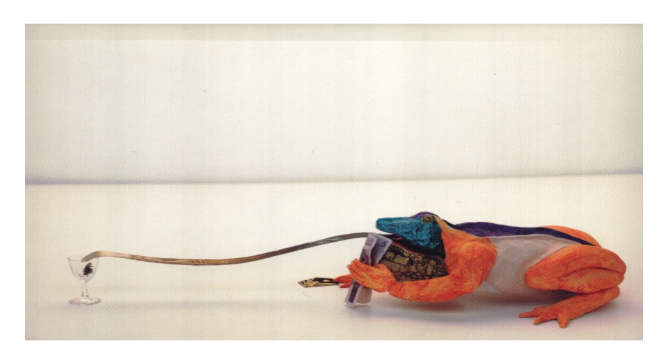
"Sappo - The Brazilian Gambler" (Figure 7)

In 1996, residents of Los Angeles voted on a proposition dealing with the funding of after school programs focusing on tutoring in core subjects and providing intramural sports programming. Opponents called the proposition funding for "midnight basketball," a thinly veiled racist campaign that succeeded when the proposition failed. Not all opponents, to be sure, reflected the racist attitude that "midnight basketball" was a gift to inner city African American youth, but this appeal clearly affected enough voters to defeat an educationally important ballot measure. Davis's artwork is a stark reminder of the deeper value of youthful creativity and imagination and a protest against the foolish notion that intramural sports funding was somehow a frivolous expenditure for Los Angeles taxpayers. As a longtime educator as well as an artist, Davis was especially well positioned to offer this incisive visual critique.