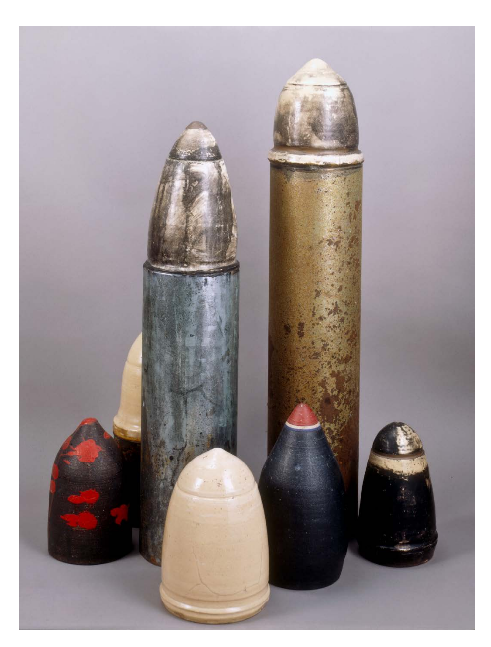
"Viet Nam War Games" (Figure 1)