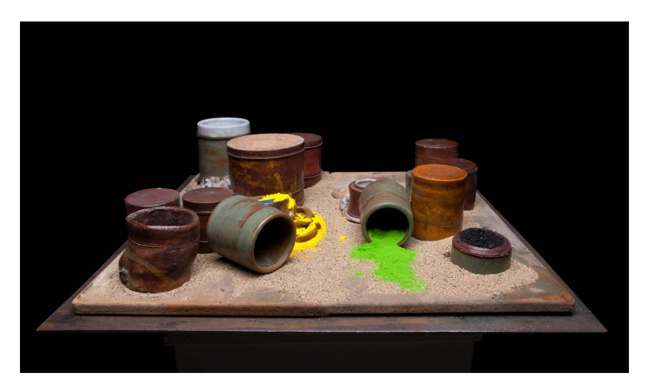
"Dioxin" (Figure 5)

In one of his most unnerving but effective artworks, Davis addressed the pollution of the contemporary environment. Stark and unromantic, "Dioxin" (Figure 5) is a three-dimensional work that calls brutal attention to the group of chemically-related compounds that pollute the environment with devastating implications for the food supply and consequently for human health, including cancer, and damage to the reproductive and immune systems.