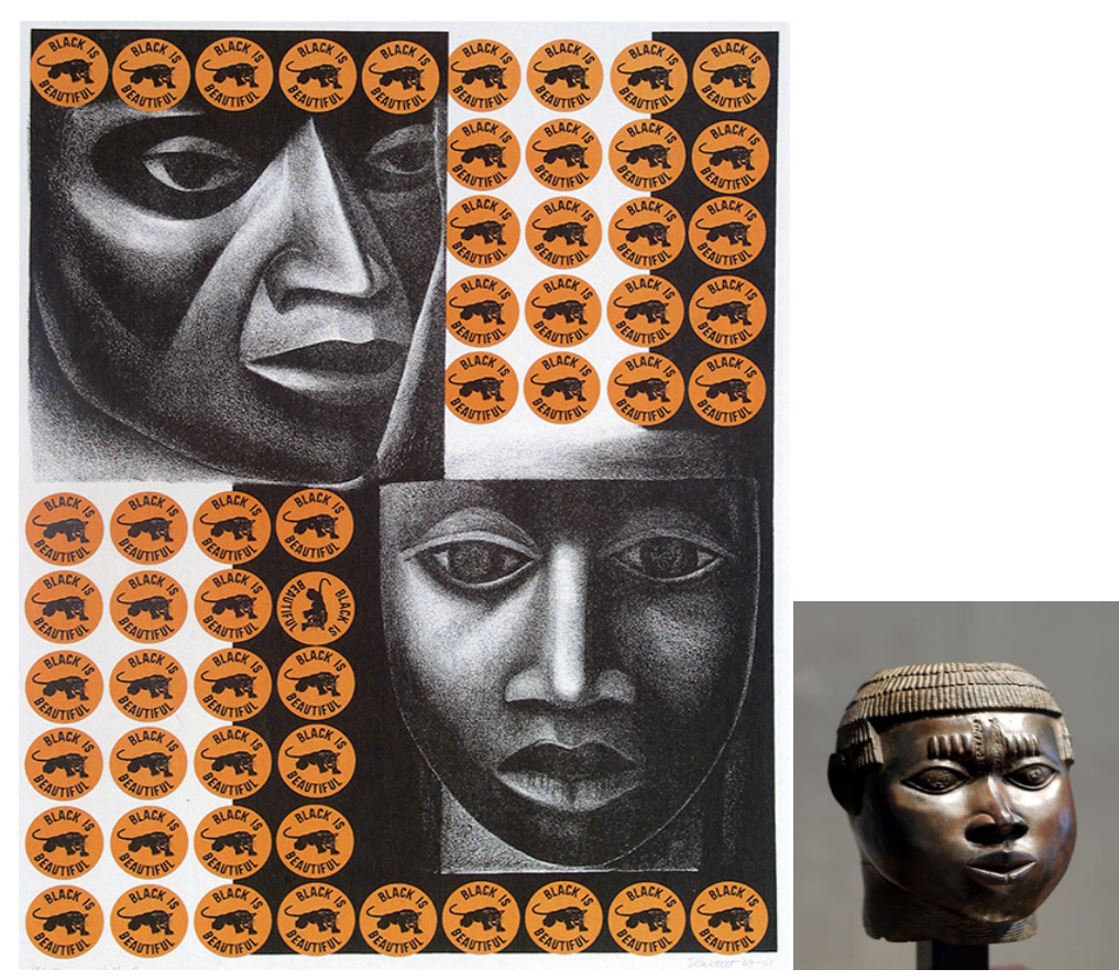
Benin, Nigeria 5a. Internet

Figure 5: Elizabeth Catlett, Negro-es Bello II , 1969 Lithograph Creating Black Americans , 290, 443