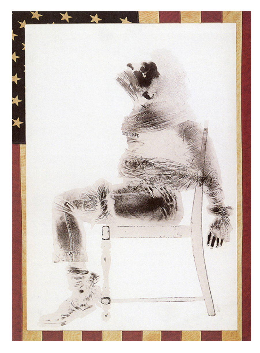
Figure 6: David Hammons, Injustice Case , 1970 Los Angeles County Museum of Art Creating Black Americans , 310, 443

Roads toward liberation went in many different routes. The Affirmative Action, for example, put forth by President Lyndon V. Johnson's Executive Order 11246 and Title VII of the Civil Rights Act of 1964 required companies working with the federal government to hire minorities (Painter, 2006).