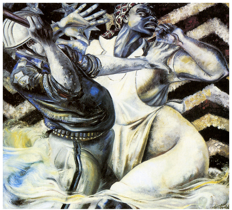
Figure 2: Jeff Donaldson Aunt Jemima & the Pillsbury Doughboy, 1963 Creating Black Americans, 278, 442

The red-checkered bandana and the apron identify the female figure as a domestic worker, which reminds us that a majority of Black women during the 1960s worked as maids in White women's homes. Yet, it was these domestic worker women who were the backbone of the Black community and the protectors of family and cultural traditions. Therefore, when the female figure is viewed as a representation of the Black community, and as the Black community becomes awakened to a social and political consciousness, they will fight back. Donaldson reveals in the background emblems of the American flag, questioning America's claim to being an equal and just society.