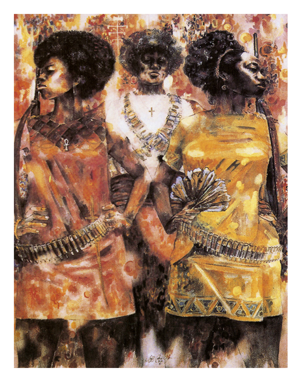
Figure 4: Jeff Donaldson, Wives of Shango , 1968 Water color and mixed media on paper Creating Black Americans , 296, 443