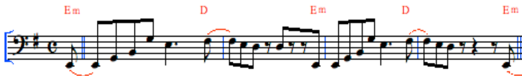
Example 7: Bass line from “Beat It.”

The bass line is unusual for pop music in that it doubles the guitar part rather than just chugging along playing the roots and fifths of the chords like in many generic rock or pop songs. However, this is consistent with much heavy metal from the '80s (e.g. in much thrash the bass doubles the guitar an octave lower; in many ways this is reminiscent of classical music.) 12 Unlike the bass line in “Don’t Stop,” this bass line is totally diatonic. There are no “blue notes” like the flattened 7 th at the end of each measure of “Don’t Stop.” The verse sections are slightly more funky, harkening back to the style of “Don’t Stop.” The bass and guitar play shots on the roots of the ‘i’, ‘VII’, and ‘VI’ chords (Ex. 8).