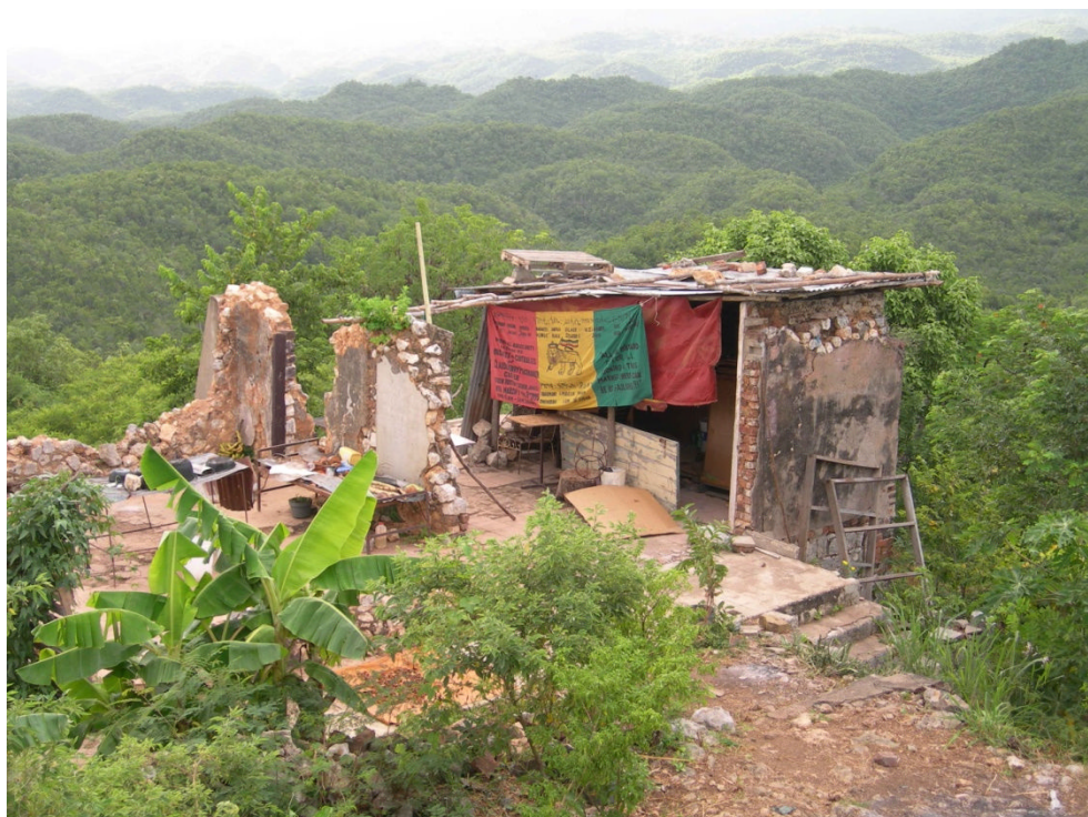
The Remains of Pinnacle.