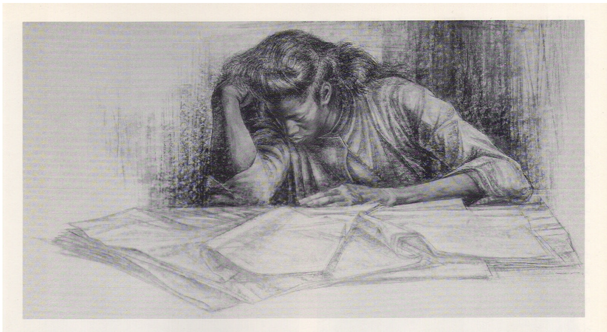
“Awaken from the Unknowing” (Figure 2)

One key focus was his emphasis on ordinary black people. Countering the racist caricatures that dominated American visual popular cultures for many decades, White instead portrayed his people as dignified, hard-working men, women, and children seeking opportunity and justice against overwhelming racial, political, and economic barriers. His J'Accuse series, which he adapted from the infamous 19 th century deliberately appropriated from Emile Zola's famous pamphlet about French anti-Semitism and the Alfred Dreyfus case, depicted African Americans of all ages, striving resolutely for full freedom in American society.