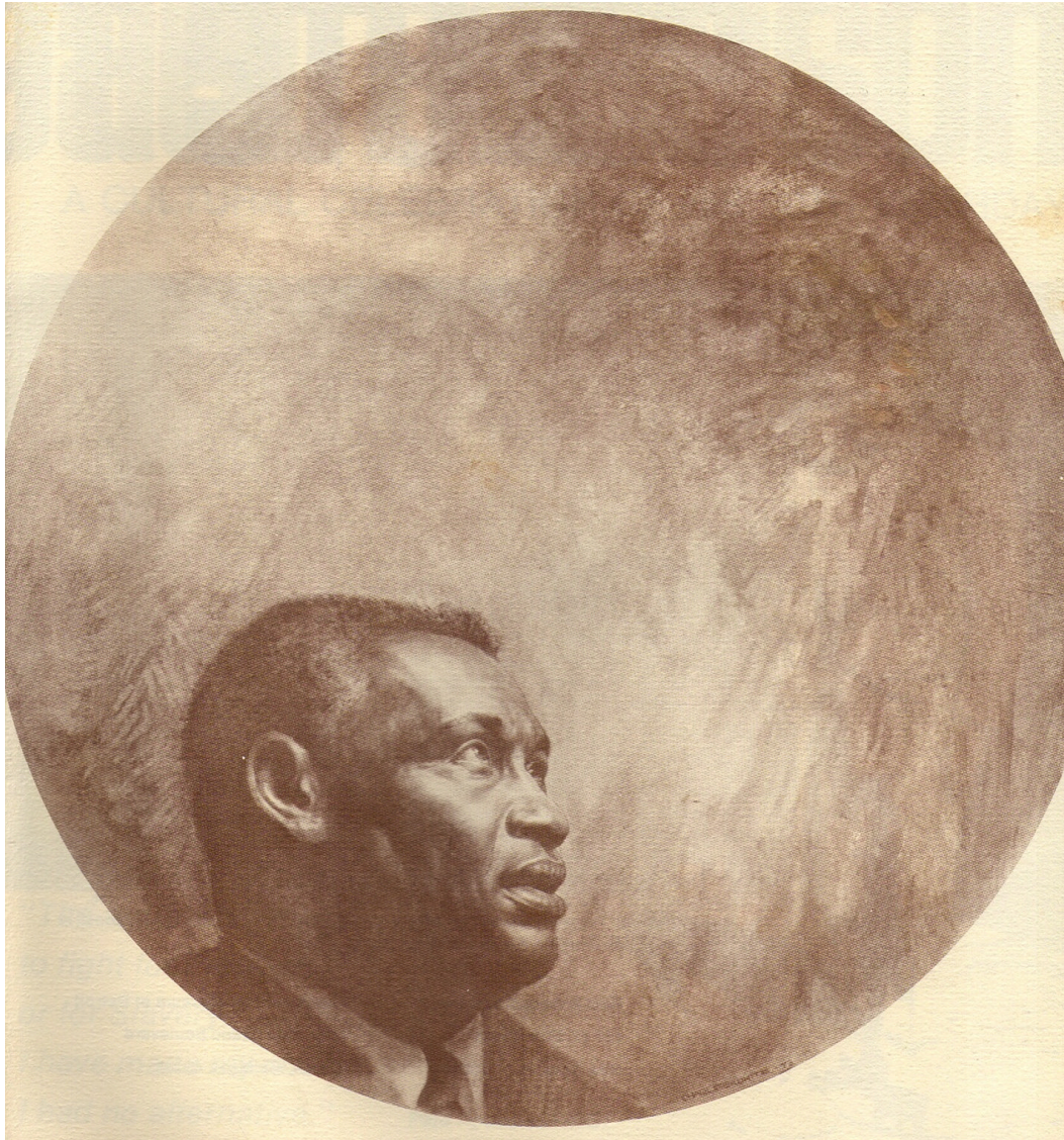
Paul Robeson (Figure 4)