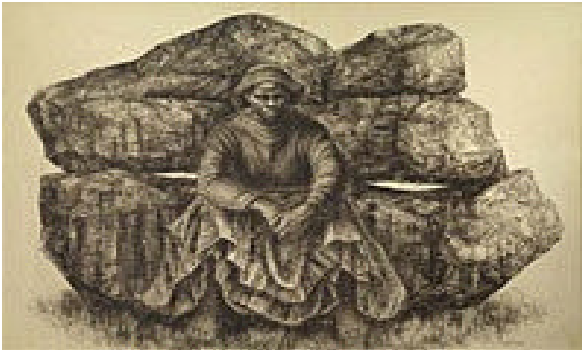
"General Moses" (Figure 3)

Throughout his career, White often focused on black females and on their spectacular but largely unrecognized significance to their race and to America generally. In 1961, for example, in "Awaken from the Unknowing" (Figure 2), he created an engaging charcoal drawing of an adolescent girl studying intently. Her facial expression reveals her profound seriousness about her educational pursuits. Head in hand, she gazes at the books in front of her, recognizing the daunting academic tasks ahead. But above all, her determination to succeed despite the challenges emerges as the central theme of this drawing. White's work, accordingly, reveals a dual message to its audience. On one level, it illustrates how a young African American woman can overcome the odds through sheer persistence and will—a model, in fact, for millions of other young people in black communities throughout the land. At a deeper level, this drawing reflected the artist's profound commitment to education itself. White well understood that knowledge is power—the key to both individual and political liberation. He understood too that the corollary is equally true; the lack of knowledge leads inexorably to the lack of power, both personally and politically.