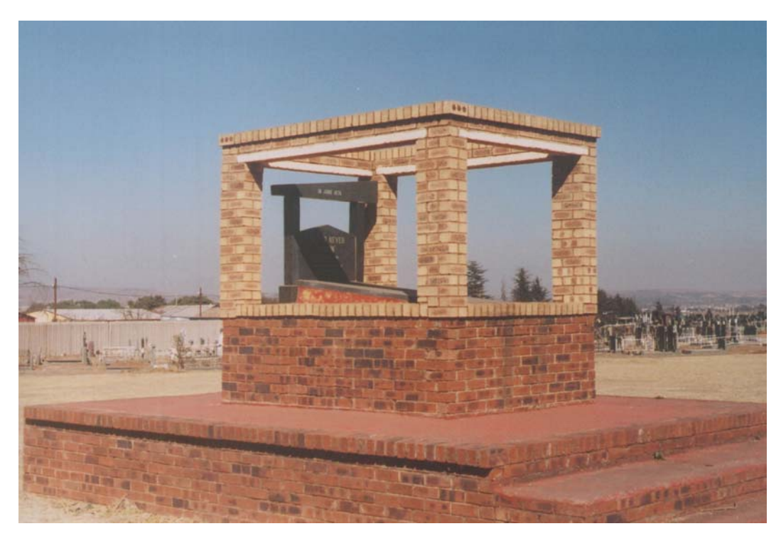
EVER NEVER AGAIN "Dedicated to all those who lost their lives on this day & there after 20<sup>th</sup> commemoration 16 June 1976

This memorial stone also feature a poem by Mzwakhe Mbuli paying tribute to contributors across generations.