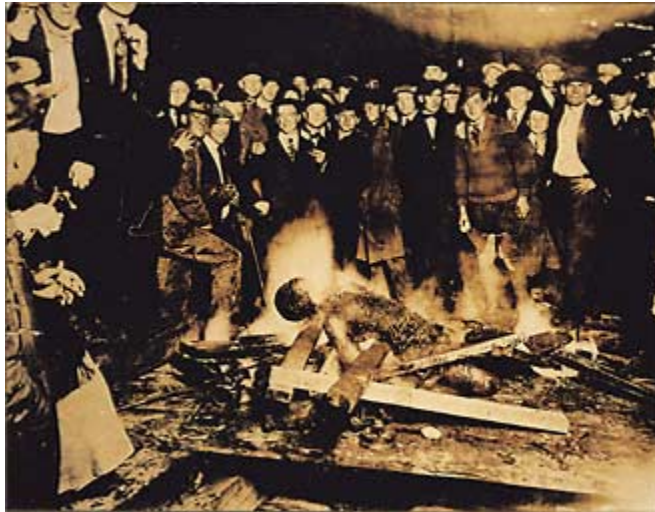
The Burning corpse of William Brown, September 18, 1919 in Omaha, Nebraska.

To connect this history with contemporary issues of mass incarceration, the museum will employ narratives that reveal the racially biased administration of criminal justice, police violence, and wrongful convictions. The museum will feature new art pieces by contemporary African American artists, including Sanford Biggers and Hank Willis Thomas.